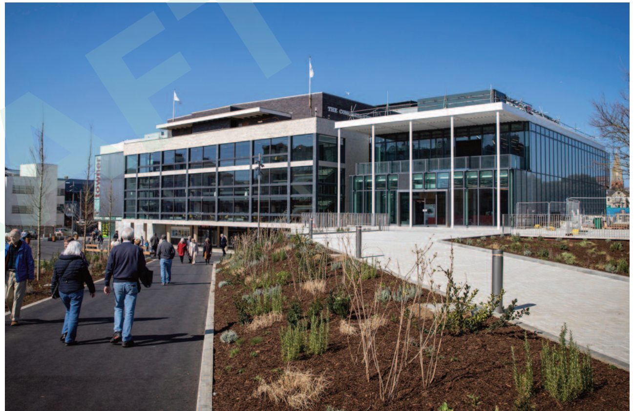
RIGHT Congress Theatre and Welcome Building