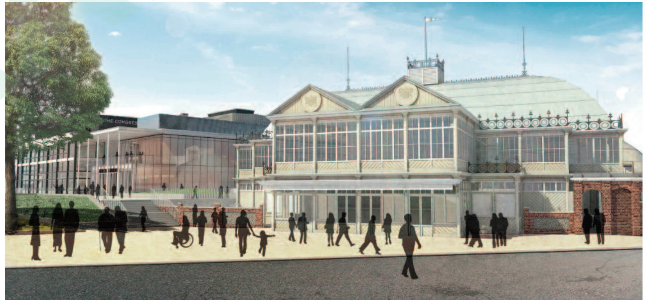
RIGHT Winter Garden